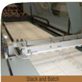
Stack and Batch