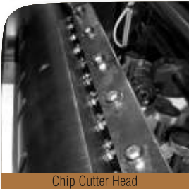
Chip Cutter Head