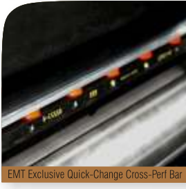
EMT Exclusive Quick-Change Cross-Perf Bar