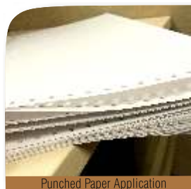
Punched Paper Application